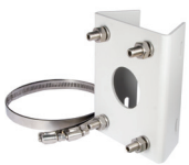
VT-MDPLMT Mighty Dome Pole Mount