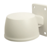
VT-MD/WMT Mighty Dome Wall Mount