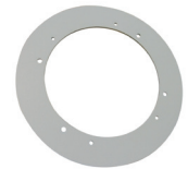
VTD-MD-FMP Mighty Dome Flush Mount Decorator Plate