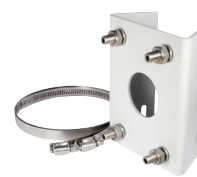
VT-MD/PLMT Mighty Dome / VT-PTZ10 Pole Mount Adapter