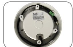
The Mighty Dome Vandal base has been designed to manage and protect video and power cables without the need for external adaptors.