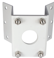
VT-MD/CNMT Mighty Dome / VT-PTZ10 Corner Mount Adapter