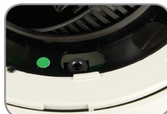
Secondary Video Output Enables Ease of Adjustment after Installation.