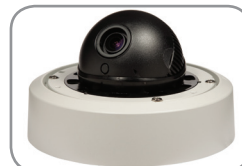
Friction Fit Ball Mount Camera Module Can Achieve Virtually Any Viewing Angle.