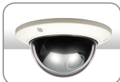
Can be Surface Mounted with Included Surface Mount Casing or Semi-Flush Mounted for Sleek, Low Profile Installation.