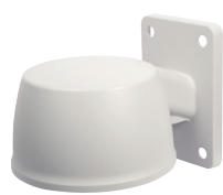
VT-MD/WMT Mighty Dome / VT-PTZ10 Wall Mount