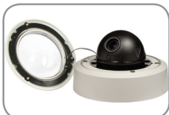
Fully Gasket Sealed IP68 Rated Weatherproof Design.

The VITEK ENVI Series Outdoor 1.3 & 2.0 Megapixel IP Cameras offer an IP-68 Weather/Vandal Resistance Rating and deliver real time live video up to 30fps @ 1920x1080p over a TCP/IP Network. Crystal clear images are achieved without tearing by use of a progressive scan CMOS image sensor. Minimal network bandwidth and storage space is needed due to the most advanced H.264 Video Compression algorithm. Motion JPEG is also supported for maximum flexibility and integration possibilities.