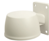
VT-MD/WMT Mighty Dome Wall Mount