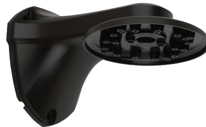
VT-AP/WMT/B Optional Indoor Wall Mount (Black)