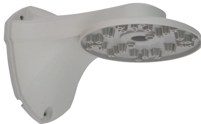
VT-AP/WMT/W Optional Indoor Wall Mount (Ivory)