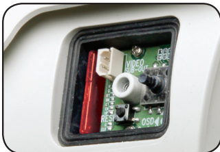
SD Memory Card Slot, Secondary Video Output & OSD Control Joystick are accessible inside a Gasket sealed removable side panel.