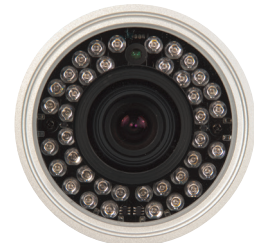
Dual Glass Compartments to Eliminate Glare.