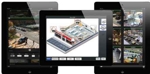
ENVI Mobile App ENVI Remote Viewing App for iPad/iPhone & Android Devices

The VITEK ENVI Series Outdoor 1.3 & 2.0 Megapixel IP Cameras offer an IP68 Weather/Vandal Resistance Rating and deliver real time live video up to 30fps @ 1920x1080p over a TCP/IP Network. Crystal clear images are achieved without tearing by use of a progressive scan CMOS image sensor. Minimal network bandwidth and storage space is needed due to the most advanced H.264 Video Compression algorithm. Motion JPEG is also supported for maximum flexibility and integration possibilities. All ENVI cameras also offer EDGE Recording with onboard SD or MicroSD card slots for on camera backup with remote access & playback.