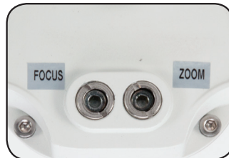
Gasket sealed externally adjustable Focus & Zoom with clutch to eliminate over-tightening.