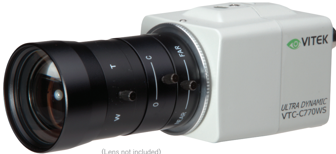
(Lens not included)

700 TVL Pixim Powered Ultra Dynamic Range Color CCD Camera