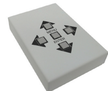
Optional Remote OSD Controller VT-UTCC