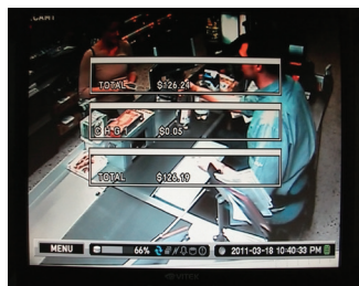
Direct Connect Point of Sale Feature (No Interface Needed)